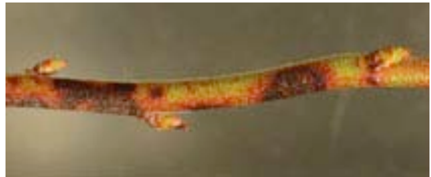
Septoria on stem